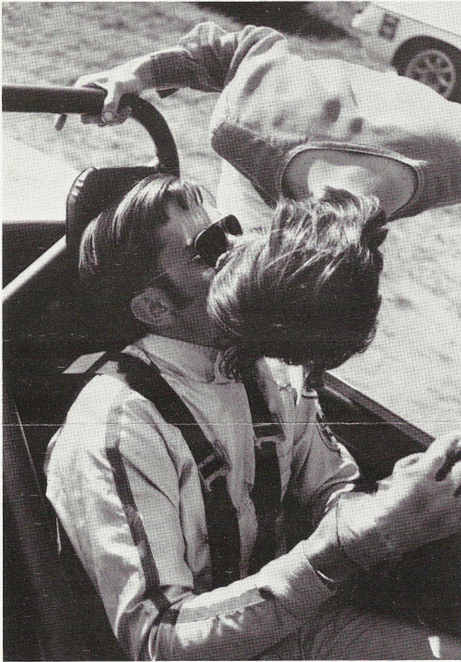
Race driver receives mouth-to-mouth resuscitation after hot and heavy competition.