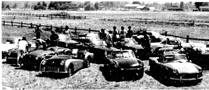
The PTOA Corral last August