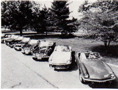
An annual photo session is a novel event organised by the Long Island Triumph Association. Here is a group shot taken in Eisenhower Park, L.I. last summer, of representative member's cars.