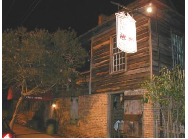
King’s Tavern circa late 1700’s