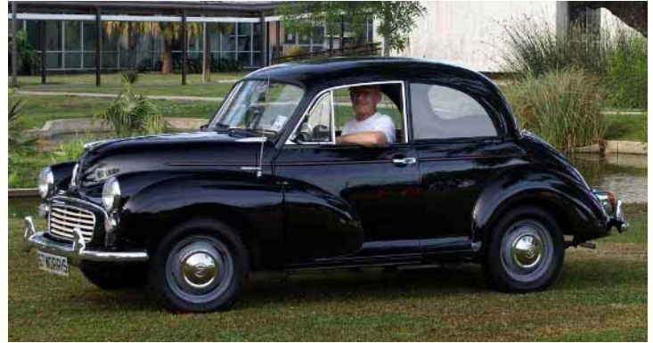
1967 Morris Minor Sedan