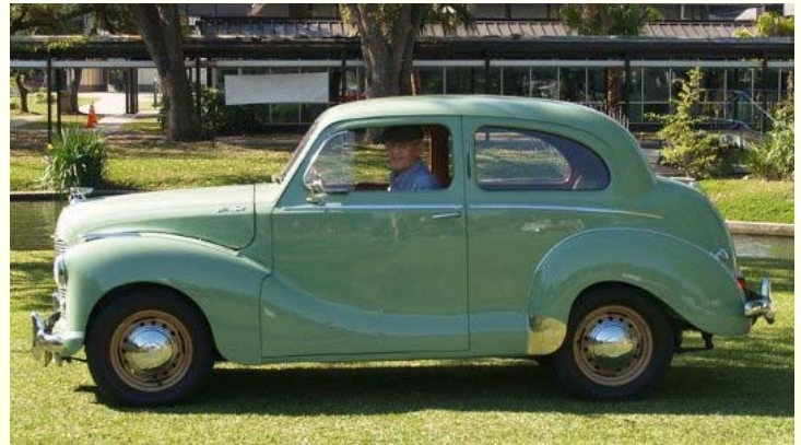
1949 Austin Dorset