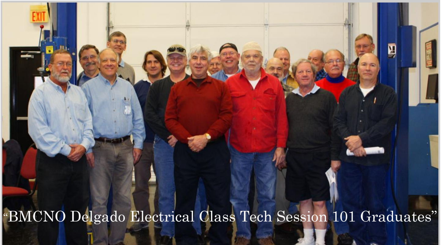
"BMCNO Delgado Electrical Class Tech Session 101 Graduates"