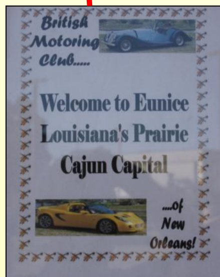
This BMCNO WELCOME TO EUNICE was posted on the front door of the Liberty Center.