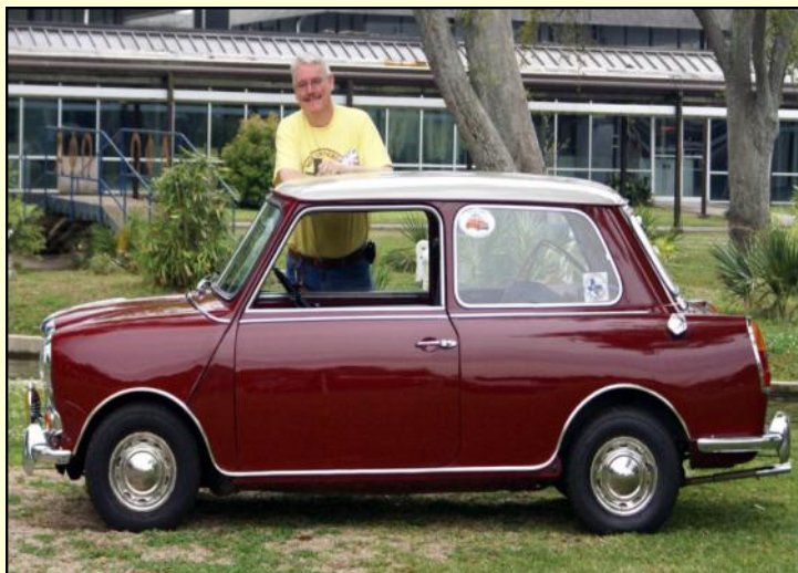
18th Annual New Orleans British Car Day March 29, 2008