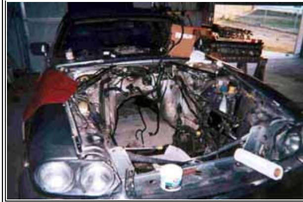
Baker's V12 with the engine removed. Sad looking isn't it?

The Rebuild: We had the heads done at a local shop and then went through the time consuming task of shimming the valve clearance. For those of you unfamiliar with Jaguar engines, the shims consist of different thickness "buttons" that go on top of the valve stem, sandwiched under the bucket tappet that the cam lobe rides against. First, you record the letter on the button, which corresponds to the thickness, install the cam, measure the clearance and change buttons until the correct thickness is obtained.