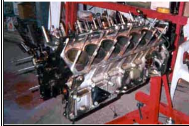
Baker's block waiting for the crankshaft.

After several nights tracing wires with a multimeter, we concluded that the short had damaged either the power resistor or the Fuel Injection ECU. We had power to the injectors, but they are not receiving the signal to open. Back to the chat room. The ECU was sent to Houston to Corsaro Electronics to be checked out. Nothing was found to be damaged in the box. We put it back in the car, but the problem still exists.