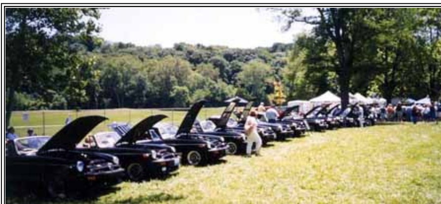
15 LE's in a row!

On Friday, June 19, tech sessions at the Sheraton Westport were offered but we decided to partake in the Gastronomical Bus Tour instead. The tour started at Soulard Farmer's Market for fresh produce then went to Gus' Pretzels for pretzels stuffed with Saliccia (Italian sausage). The tour then