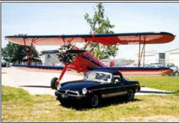
MGB-LE with an antique airplane

Later that night, the awards banquet was held at the Sheraton in which everyone who attended (over 300 people) enjoyed the food and the awards presentation. As the winners were announced, pictures of their cars were shown on a large screen. . We were awarded second place in the Limited Edition category and received our third place award for the valve cover races. The 50/50 raffle was given away. ($1000 was split). The remainder of the night was filled with attending the Hospitality Room, parking lot parties, and saying our good-byes.