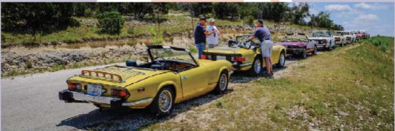
All photos courtesy Don Couch Photography