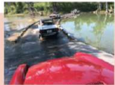
Enjoy the roads at the Gateway to the Hill Country

Join the Hill Country Triumph Club of Austin as we celebrate