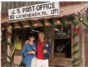
Visit Luckenbach, TX With Willie & The Boys

Join the Hill Country Triumph Club of Austin as we celebrate