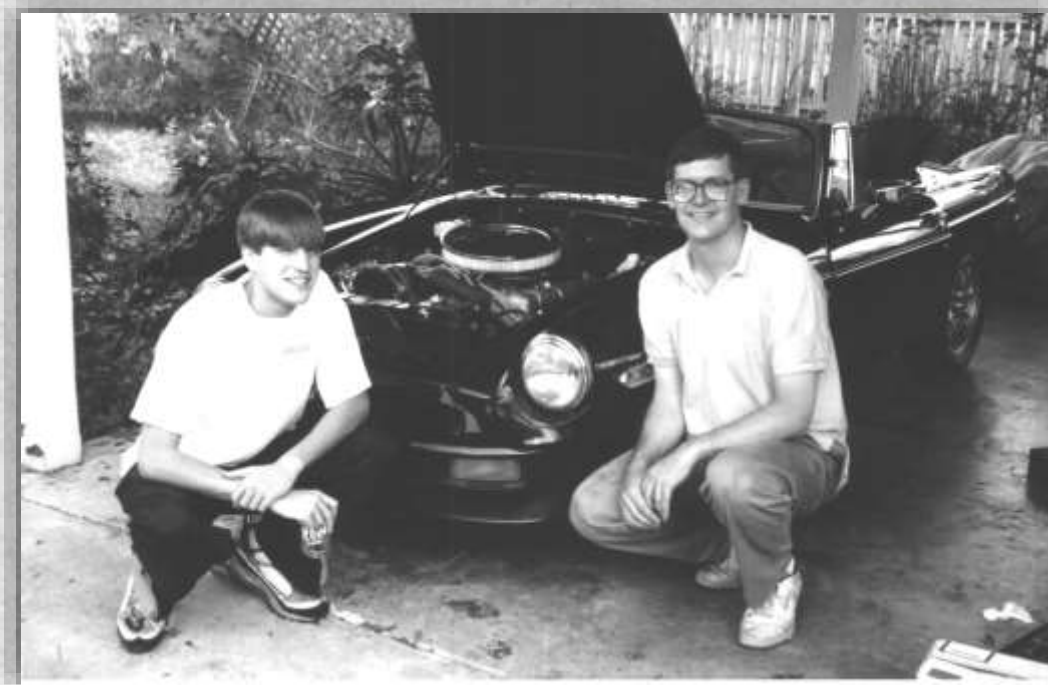
Details on the picture next month!