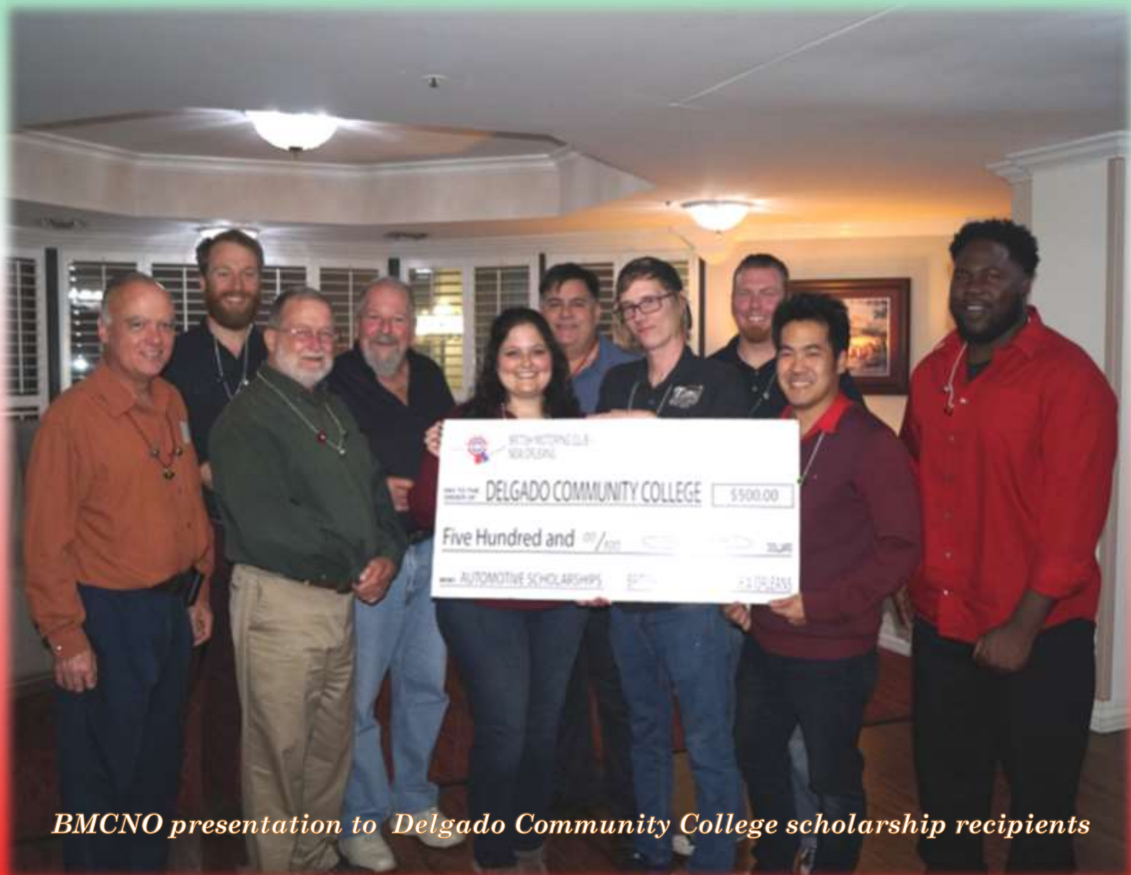
BMCNO presentation to Delgado Community College scholarship recipients

Official publication of British Motoring Club New Orleans