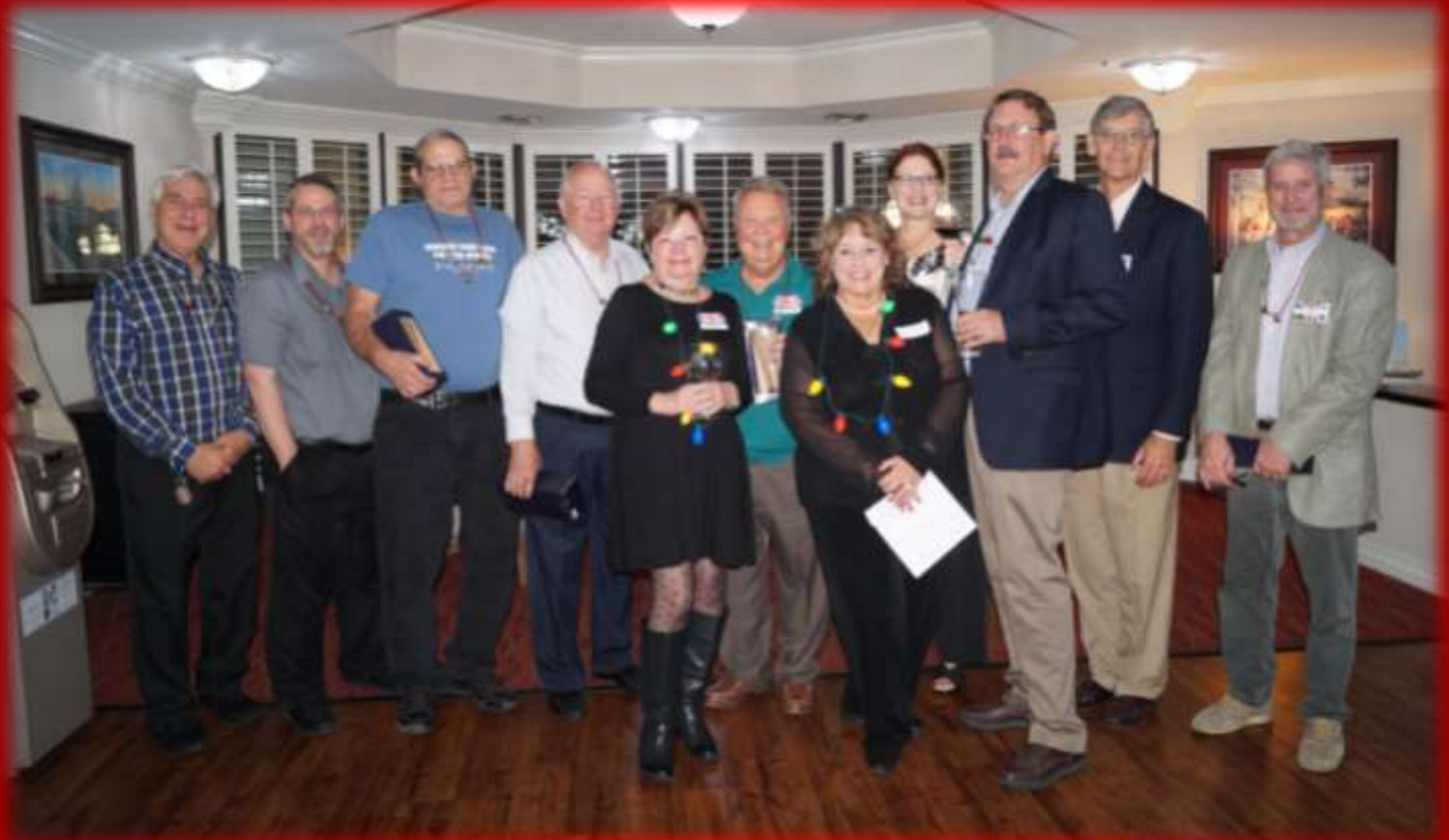
BMCNO 2017 Board of Directors and Area Coordinators