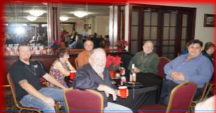
Delgado instructors and wives