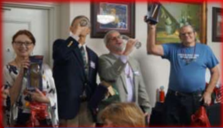
Board of Director's thank you gifts.