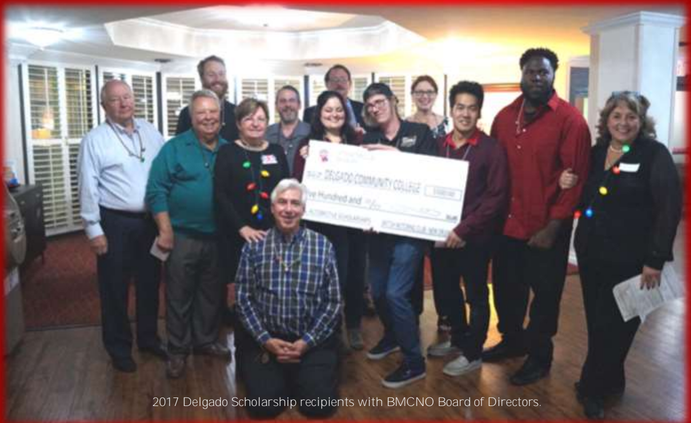
2017 Delgado Scholarship recipients with BMCNO Board of Directors.