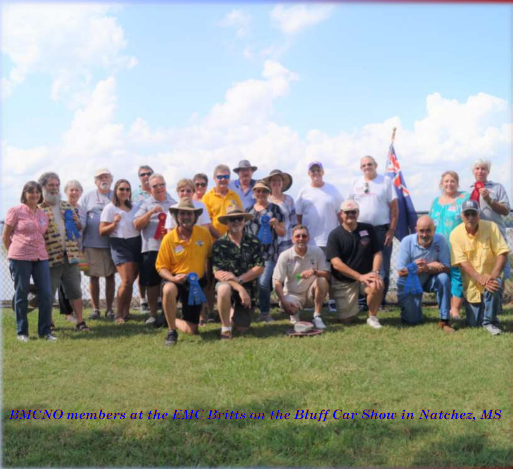
BMCNO members at the EMC Britts on the Bluff Car Show in Natchez, MS

Official publication of British Motoring Club New Orleans