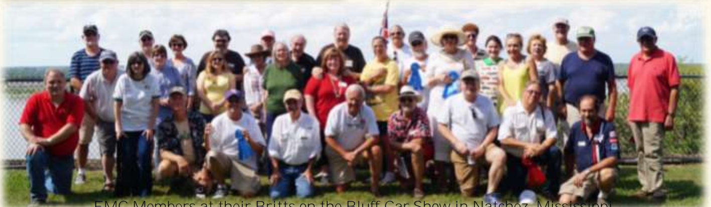
EMC Members at their Britts on the Bluff Car Show in Natchez, Mississippi